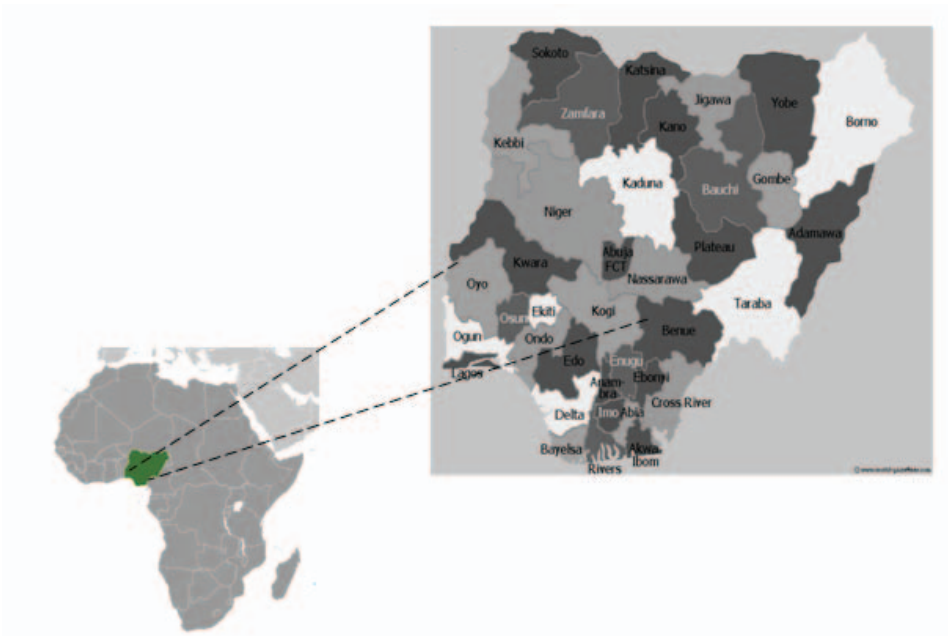
Figure 1: Nigeria's 36 states and Federal Capital Territory projected from Africa

Covering an area of 21,787 km 2 (National Bureau of Statistics, NBS, 2006), the state is one of the 37 sub-national regions (i.e. including the Federal Capital Territory, (Abuja) created after independence to facilitate effective administrative management of Nigeria 3.