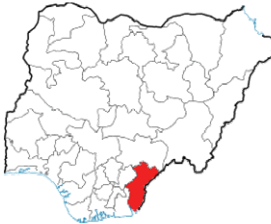
Figure 2: Nigeria showing study area: Cross River State –one of Nigeria's 36 states where the southern coastal Calabar city is capital, is shaded

The methods of description, case study and comparison were employed in this study. These methods were useful for clarifying various aspects of sub-national regional development scenarios in Calabar urban region, Cross River States and Nigeria as well as the embedded socio-economic and recent manufacturing investment development characteristics.