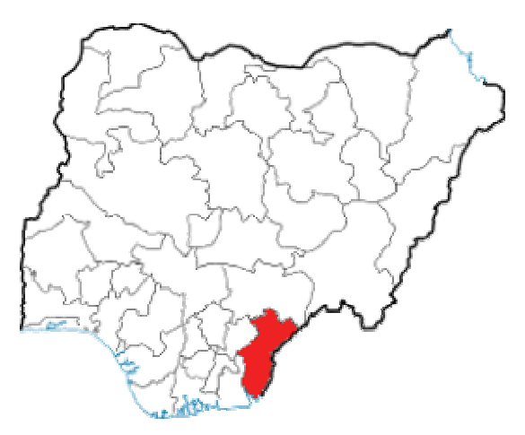
Figure 2: Nigeria showing study area: Cross River State –one of Nigeria's 36 states where the southern coastal Calabar city is capital, is shaded

Drawing from insight to the region as recently provided (Ukwayi, Ingwe, and Ojong, 2012), the region has an area of 472,704 square kilometers comprising two Local Government Areas (Calabar Municipality, 194,274 square kilometers, and Calabar South, 278,430 square kilometers. Increasing socio-economic activities is pushing the statutory boundaries of Calabar region beyond the foregoing confines. Reports of Nigeria's 2006 census put the city region's population at 371,022 (i.e. Calabar Municipality; 179,392 and Calabar South; 191, 630 (Nigeria 2007). The city-region has a reputable political and economic history in Nigeria. Its sea route and natural seaport potentials facilitated travel, arrival and establishment of a European slave trade depot that contributed large population of slaves from this part of the world to the global Trans-Atlantic Slave Trade. These facilities encouraged trade in other commodities (oil palm etc., between the Europeans and the Calabar (Efik) people. The region served as the administrative capitals for the following political entities: Southern Nigeria Protectorate, Nigeria as an amalgamation of Southern and Northern Protectorates before the capital was moved to Lagos. Thereafter, it became the capital of South Eastern State and currently Cross River State.