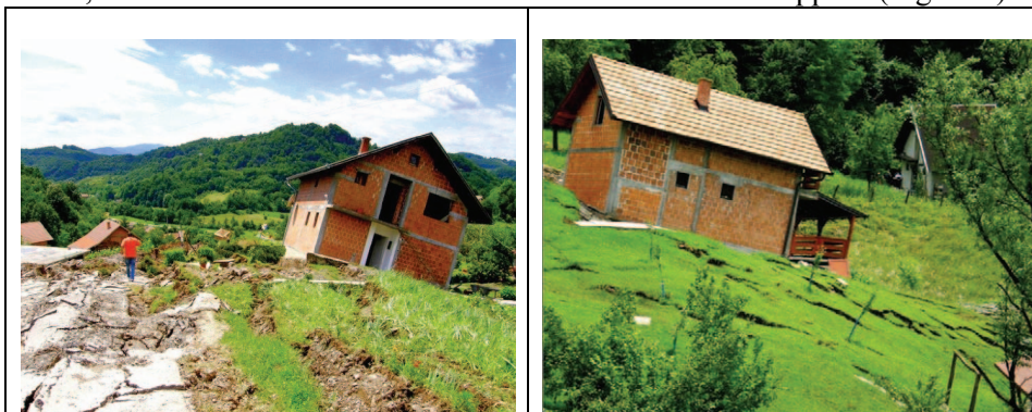
Figure 2 Demolition of houses in Suljaković (Municipality Maglaj – Bosnia and Herzegovina) http://www.crometeo.net/phpbb/viewtopic.php?f=5&t=6614

facilities, including leveling and filling from lower side, resulting imbalance of mass, disturb is natural balance conditions and then worst happens (Figure 2).