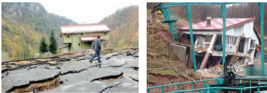
Figure 3 Landslide in Bogatići (Municipality Trnovo – Bosnia and Herzegovina) http://www.tip.ba/2010/10/30

One example of impact of landslides on forest vegetation is also landslide in Bogatići at Trnovo, which represents the largest and fastest landslide (Figure 3).