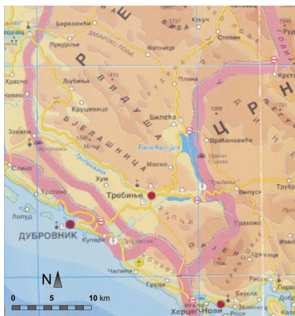
Figure 2. Physical geographical map of Trebinje area

Morphologically this is an area of typical karst terrains with all the highly developed forms of karst erosion, from corrosion forms and sinkholes to valleys and karst fields. In addition to the karst fields we emphasize the importance of the larger karst valleys and numerous sinkholes.