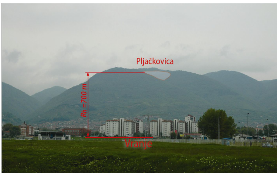
Figure 2. Position of Pljačkovica in relation to Vranje: an example of extreme relative height (topographic prominence, Rh)