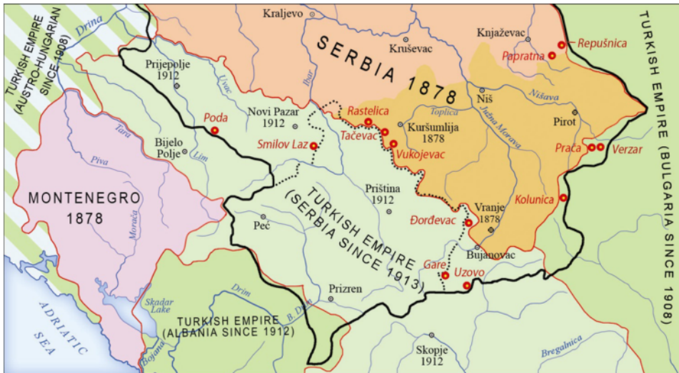
Figure 3. Map of the studied settlements in relation to the historical borders of Turkey and Serbia, in the period 1878-1913 (present border of Serbia is marked as a thick black line).

basin. The established ethnic border, determined by the political border, exists even nowadays, as a certain “history scar”.