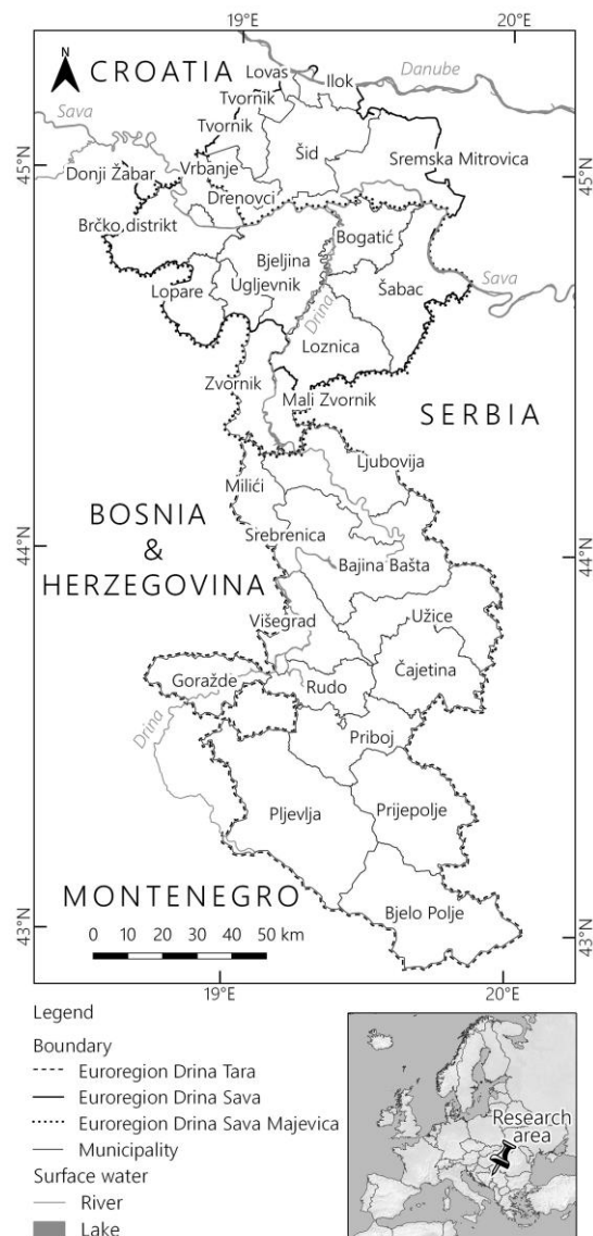
Figure 1. The map of the researched Euroregions and the municipalities belonging to them.

The research presented in the paper is based on the destinations of Podrinje on the right side of the Drina River, i.e., in “Serbian” Podrinje. It includes cities/municipalities of Podrinje that territorially belong to the Euroregions Drina–Sava–Majeвица, Drina–Sava, and Drina–Tara, on the territory of Serbia. The studied destinations are more attractive in terms of resources and tourism compared to the border destinations on the left side of the Drina River. The research should indicate that the formation of Euroregions did not condition the rapid development of the analyzed border area as a tourist destination, i.e., that it did not